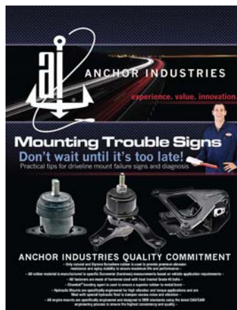
Mounting Trouble Signs Brochure