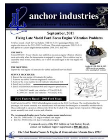
Ford Focus Tech Bulletin