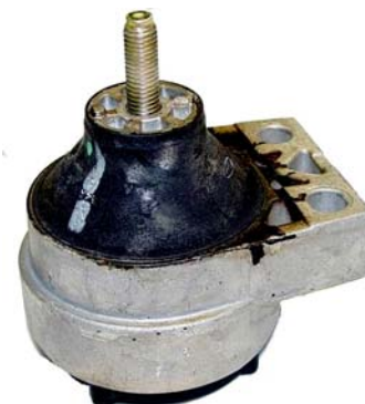
Anchor # 2938, 3003 & 3085 (difference in part numbers is the mounting hole location)

Inspect the rear engine roll restrictor for debris and install service shield.